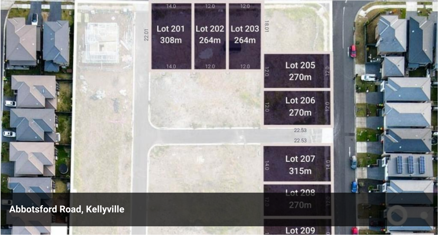
Abbottsford Road, Kellyville