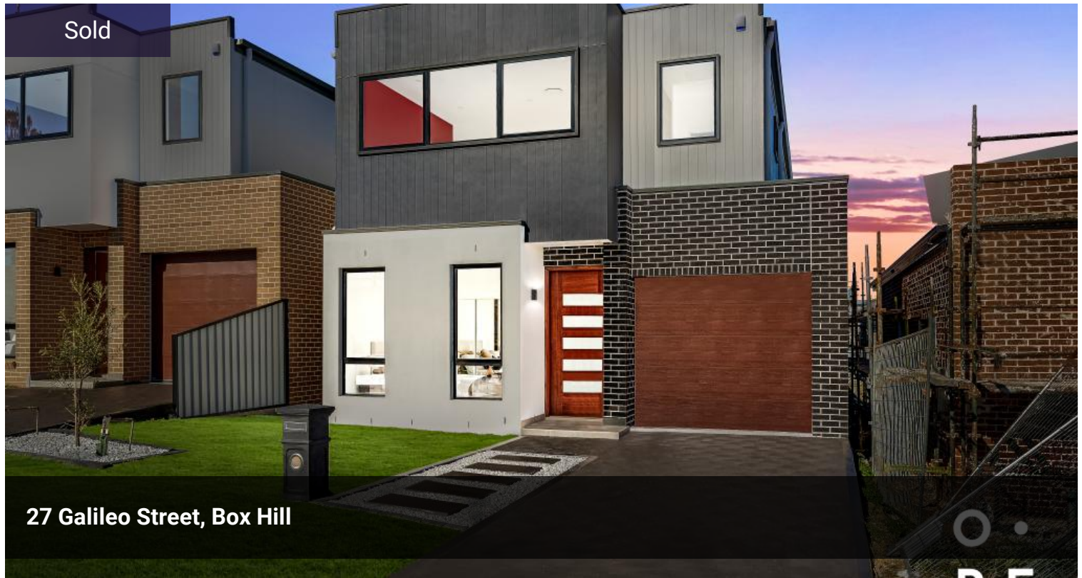
27 Galileo Street, Box Hill