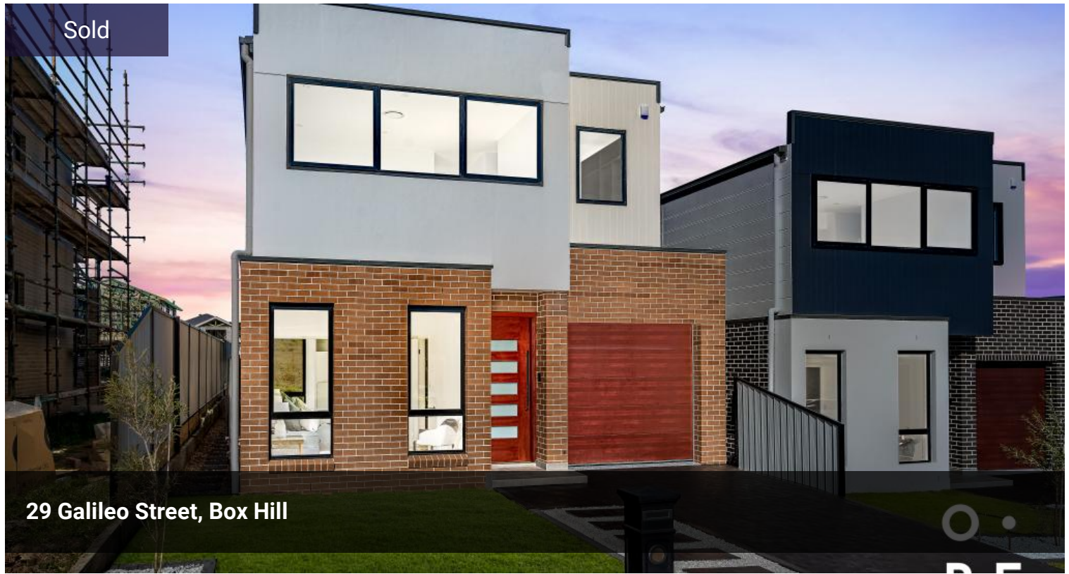
29 Galileo Street, Box Hill