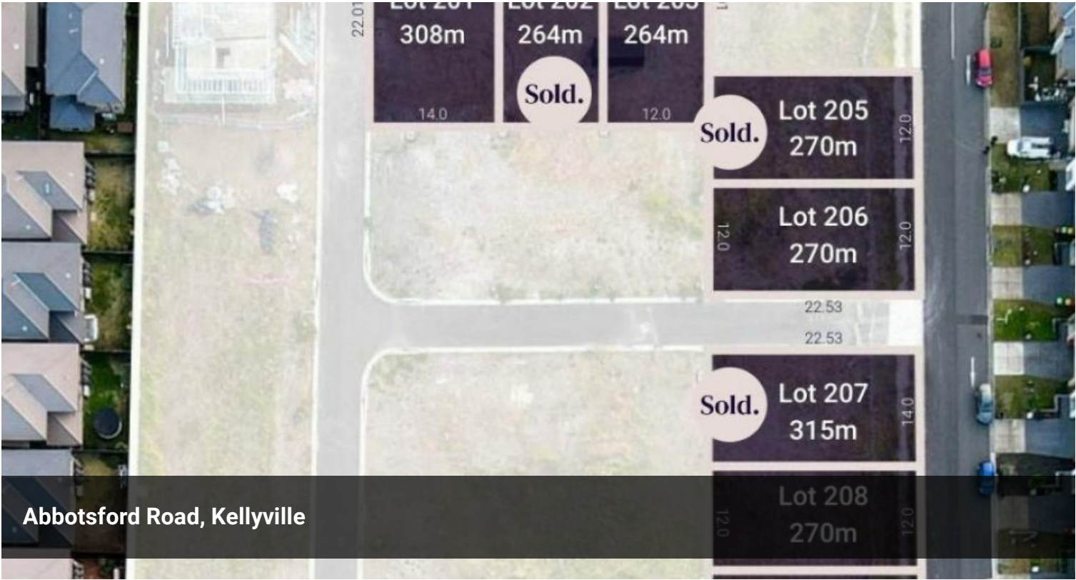
Abbotsford Road, Kellyville